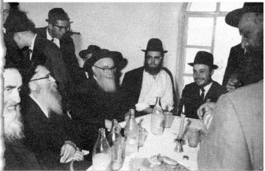
At his son's wedding, Rabbi Kitov, to the right; Rabbi Shlomo Zalman Aurbach, fourth from the right.