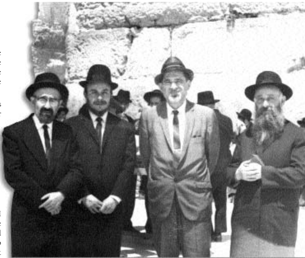
At the Kosel HaMaaravi, shortly after the Six-Day War.