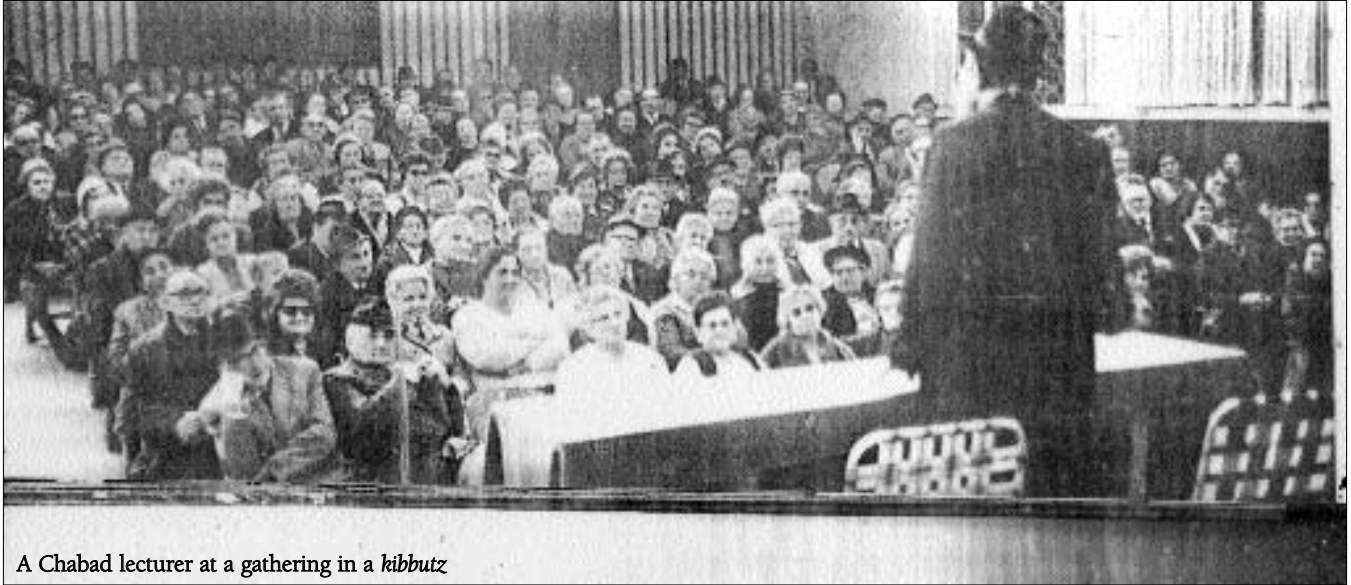
A Chabad lecturer at a gathering in a kibbutz

with the kibbutz members, and not too long afterwards, a kosher kitchen was opened for all those who were interested.