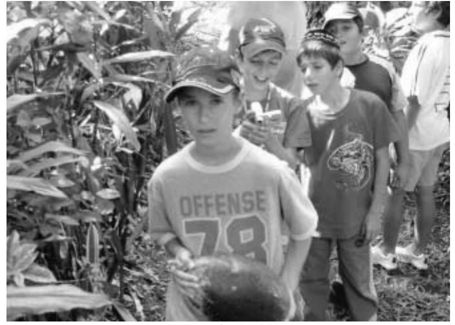
A program for the children

"The residents were afraid that the young rabbi would make a revolution. All my attempts to allay their fears were in vain. They made a clear separation between their