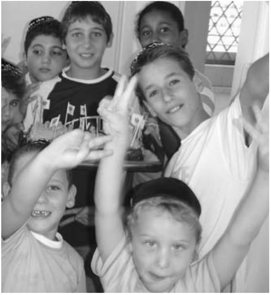
A birthday party for one of the children is used to spread the Besuras HaGeula

"The next day we went to the cemetery together where I found, to my surprise, dozens of Jewish graves. He told me that these were the graves of Jews who tried to enter Palestine but were exiled to the island. About fifty of them didn't survive and were