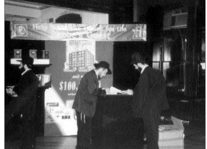
Donation table for the new Hachnasas Orchim project